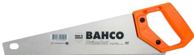
14" SAW with ORANGE HANDLE