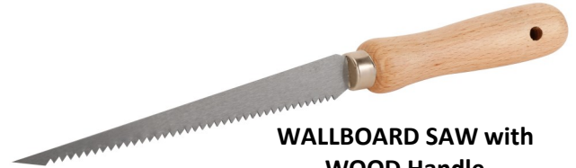
WALLBOARD SAW with WOOD Handle