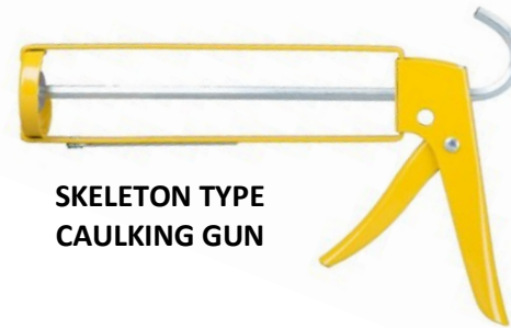
SKELETON TYPE CAULKING GUN