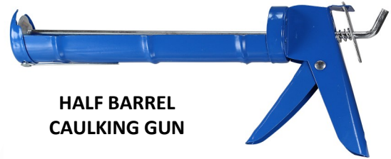
HALF BARREL CAULKING GUN