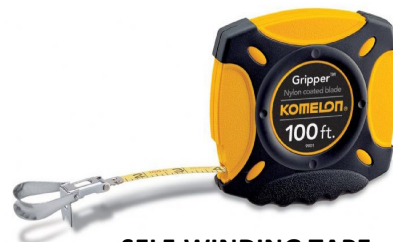
SELF-WINDING TAPE MEASURE