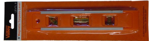
ECONOMY 9" LEVEL