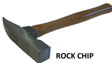
ROCK CHIP HAMMER