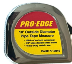
O.D. TAPE MEASURE