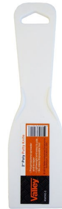
ABS PLASTIC BLADE