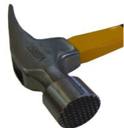
FRAMING HAMMER– MILLED FACE