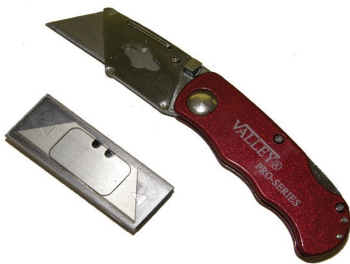
QUICK ACTION FOLDING UTILITY KNIFE