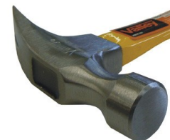
RIP HAMMER– SMOOTH FACE