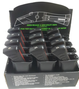
PRO-CUT UTILITY KNIFE DISPLAY CASE