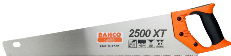
16" RAZORTOOTH SAW