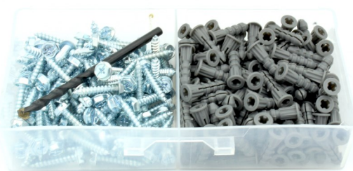
DACRONIZED SCREWS/ DACROTIZED SCREWS are deck screws