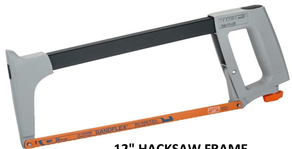
12" HACKSAW FRAME