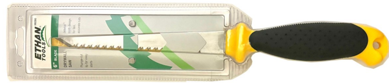
WALLBOARD SAW with Textured Rubber Handle