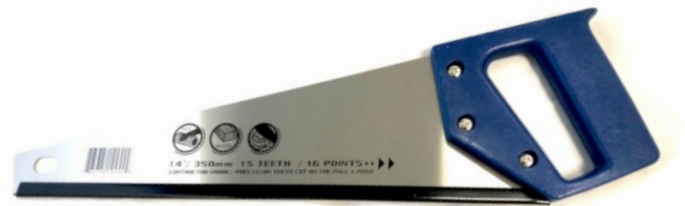
14" TOOLBOX SAW